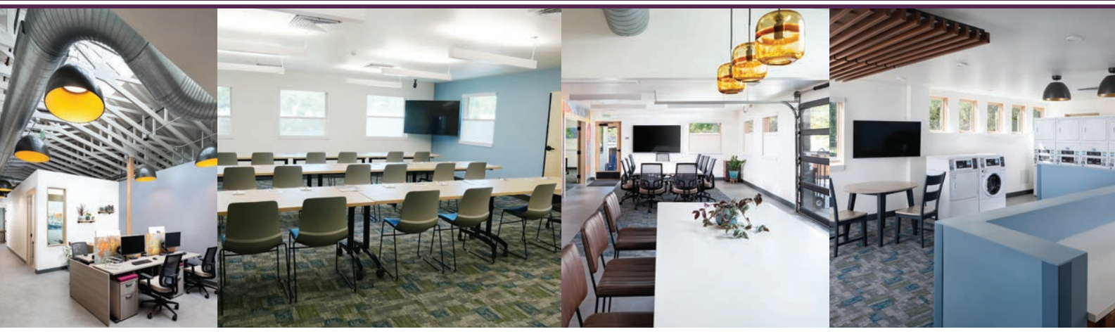
Special thanks to Krische Construction, Inc. for providing some of the rehab images on this spread